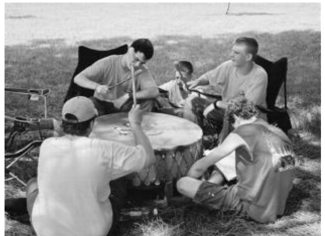
Arrowmen prepare for dancing and ceremonies at the Spring Event

Since there are a limited number of these patches available it is expected that they will sell out quickly. If you want to make sure that you get one of these Historic Lodge Flaps for your collection, you need to contact a contingent member and make arrangements to purchase a set from them.