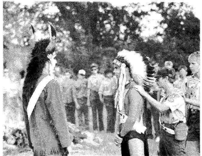
Kichkinet leading Ordeal Candidates to the Ordeal Ceremony

If you missed this years conclave, don't worry! There will be another one next year for you to attend that will be just as fun and informative as this years.